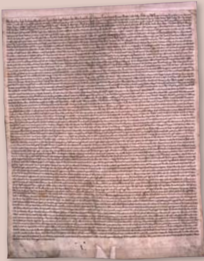
Four remaining original copies of the Magna Carta.